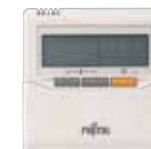
Wired Remote Controller