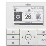
Wired Remote Controller (High grade)