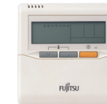
Wired Remote Controller